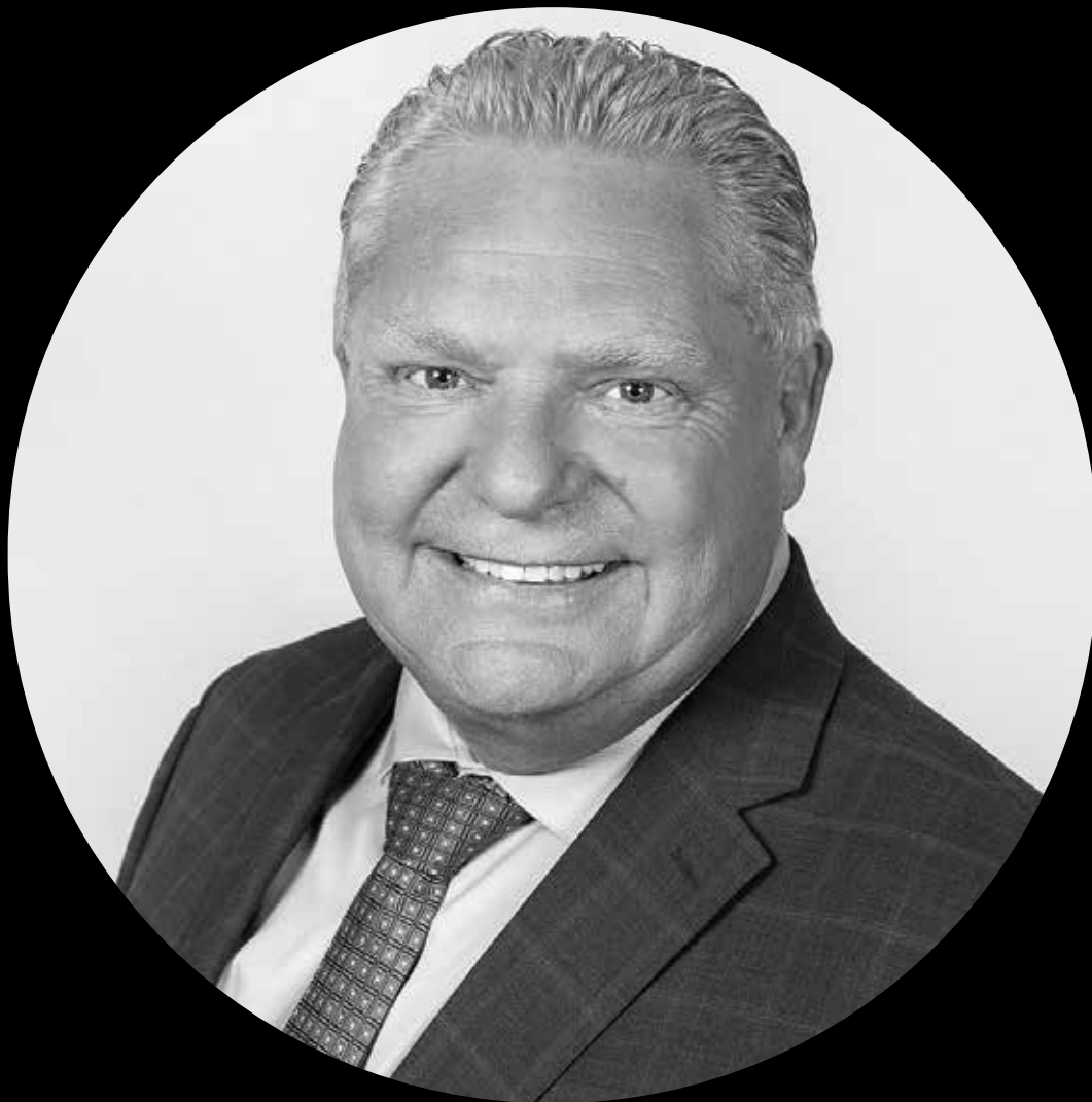
The Honourable Doug Ford