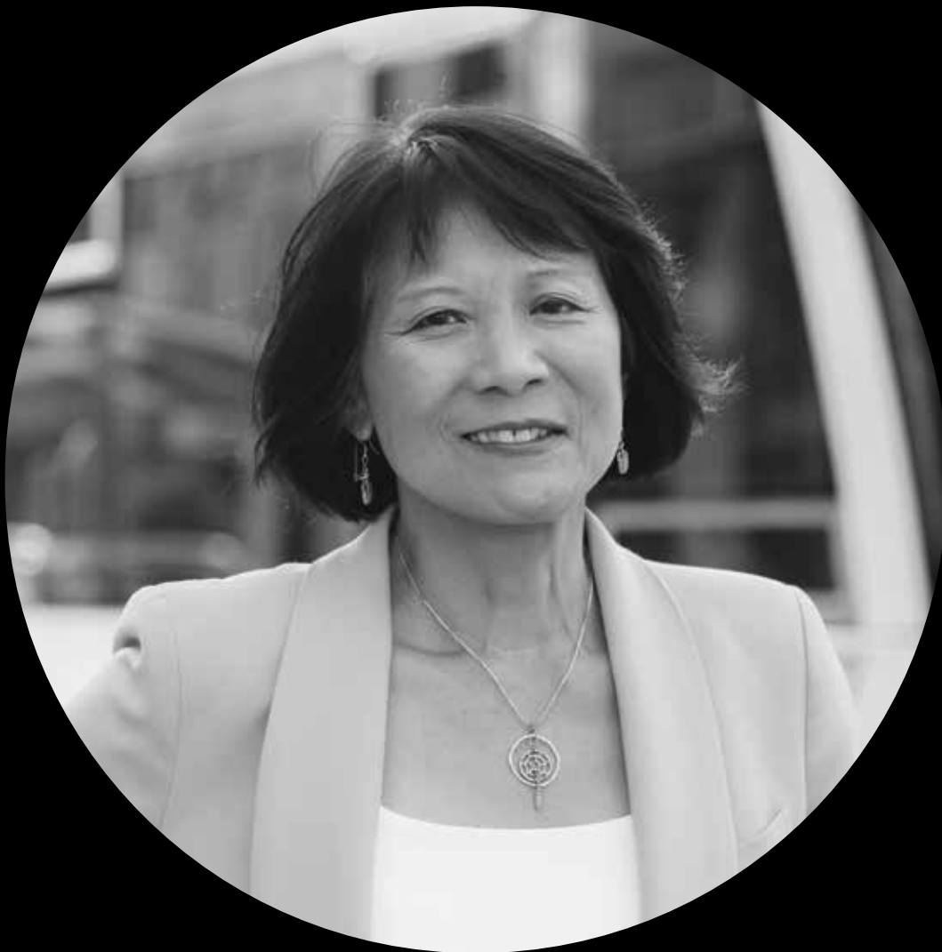
Her Worship Olivia Chow