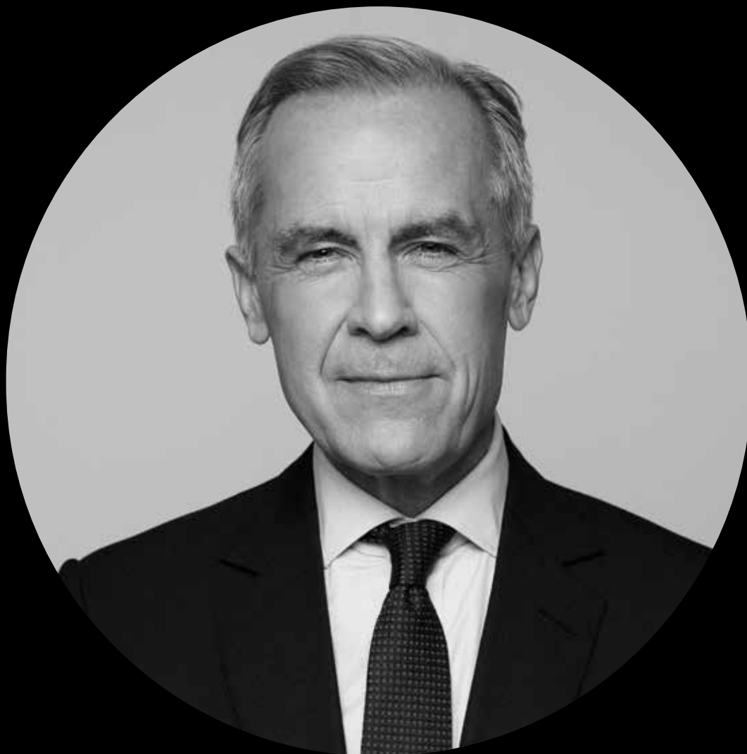
The Right Honourable Mark Carney