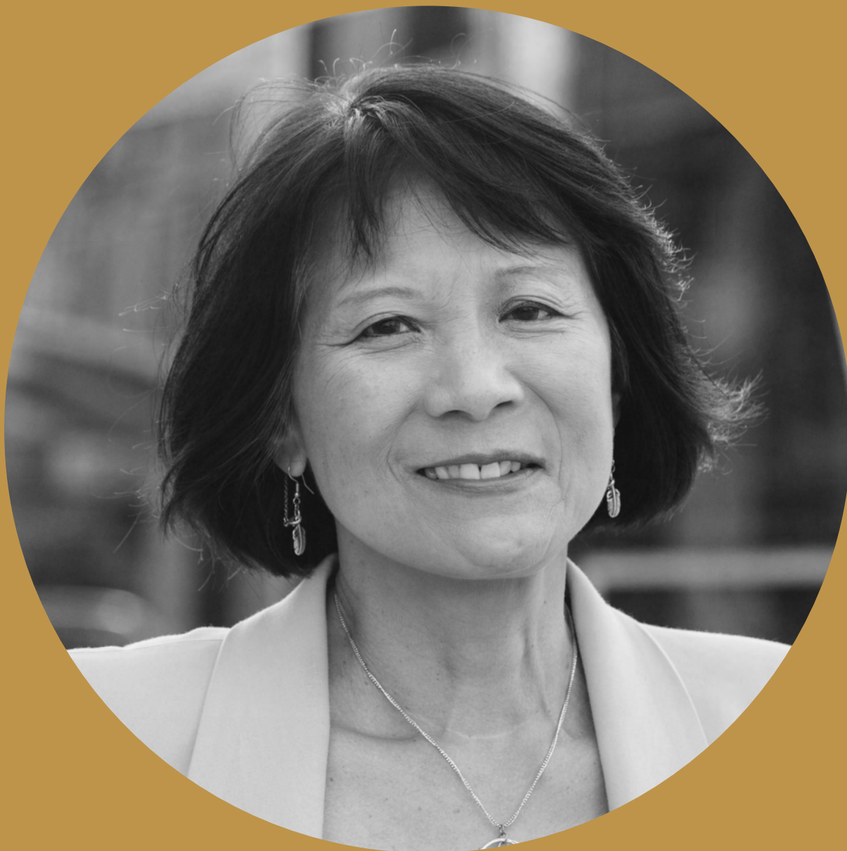
Olivia Chow Mayor of Toronto