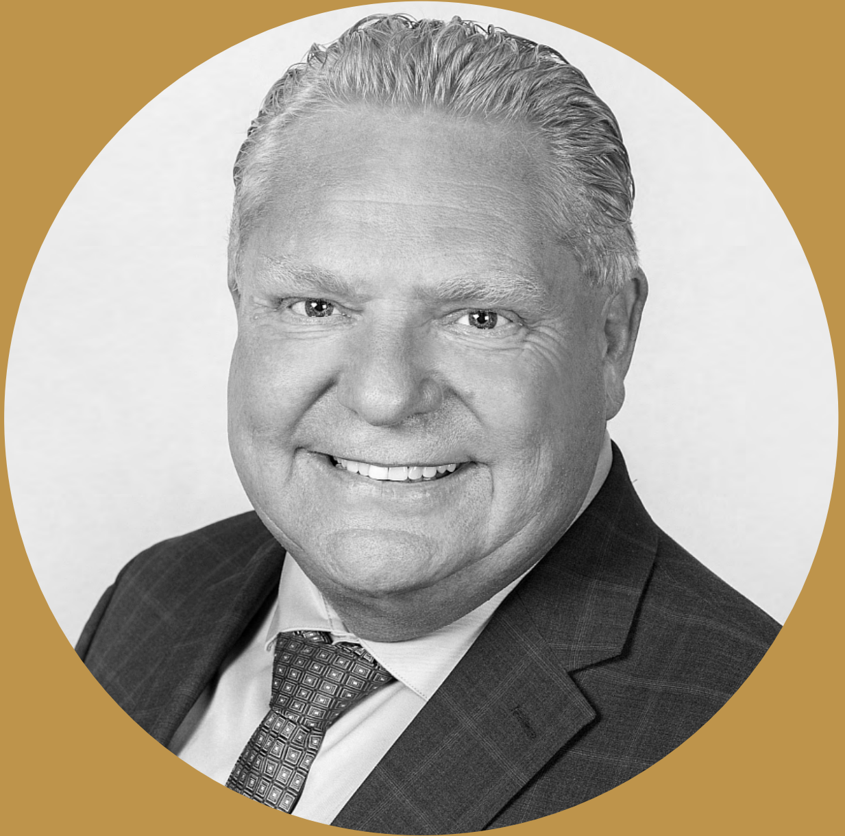
Doug Ford Premier of Ontario