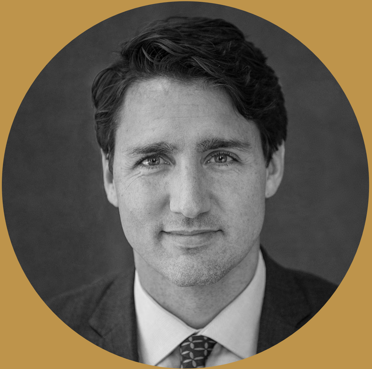
Justin P. J. Trudeau Prime Minister of Canada