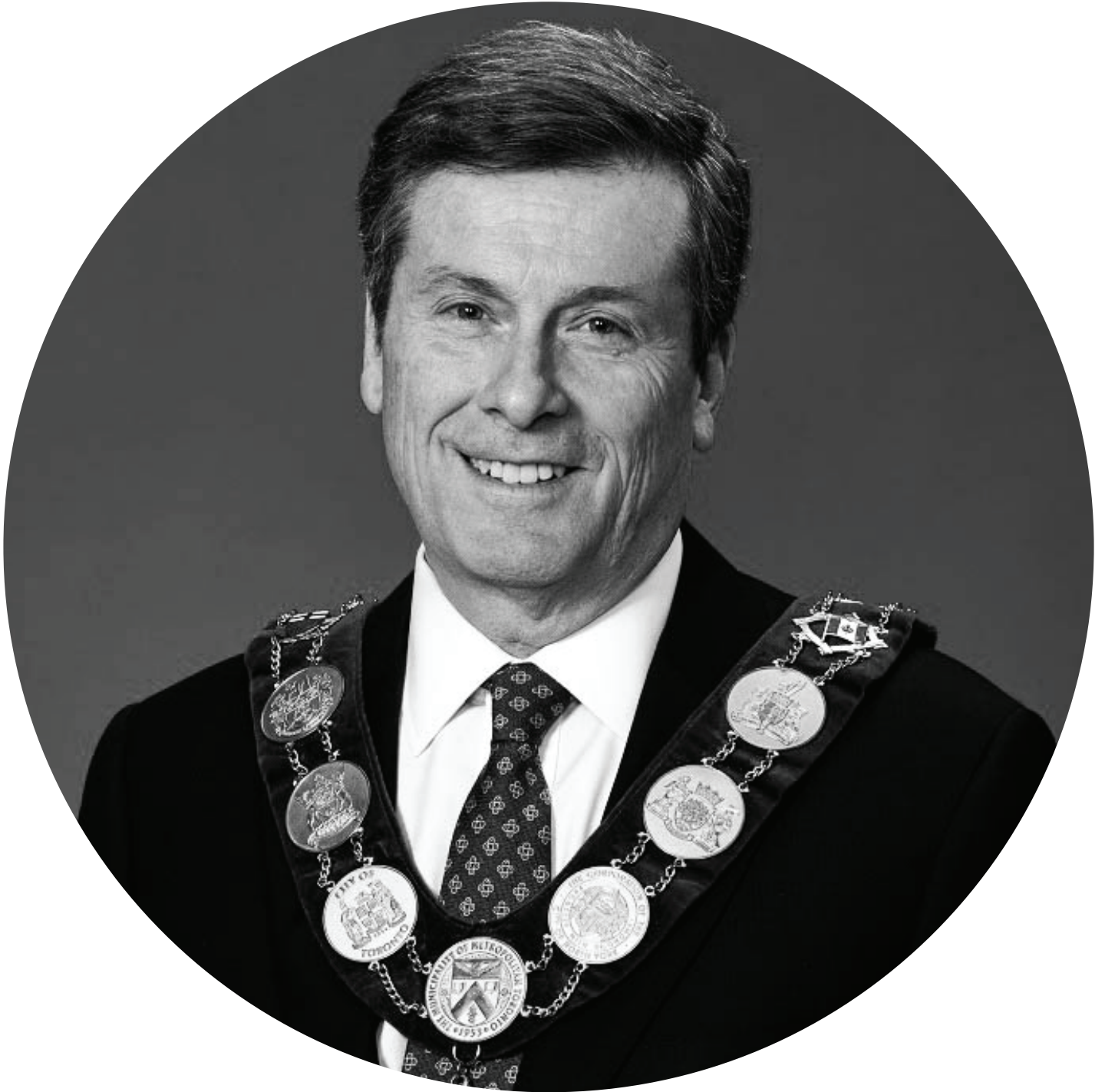
John Tory Mayor of Toronto