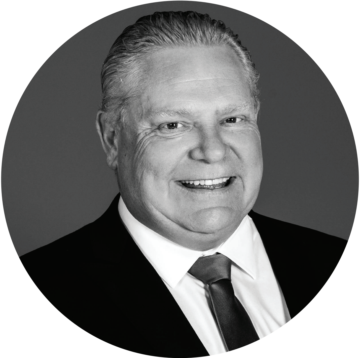
Doug Ford Premier of the Province of Ontario

Premier of Ontario - Premier ministre de l'Ontario