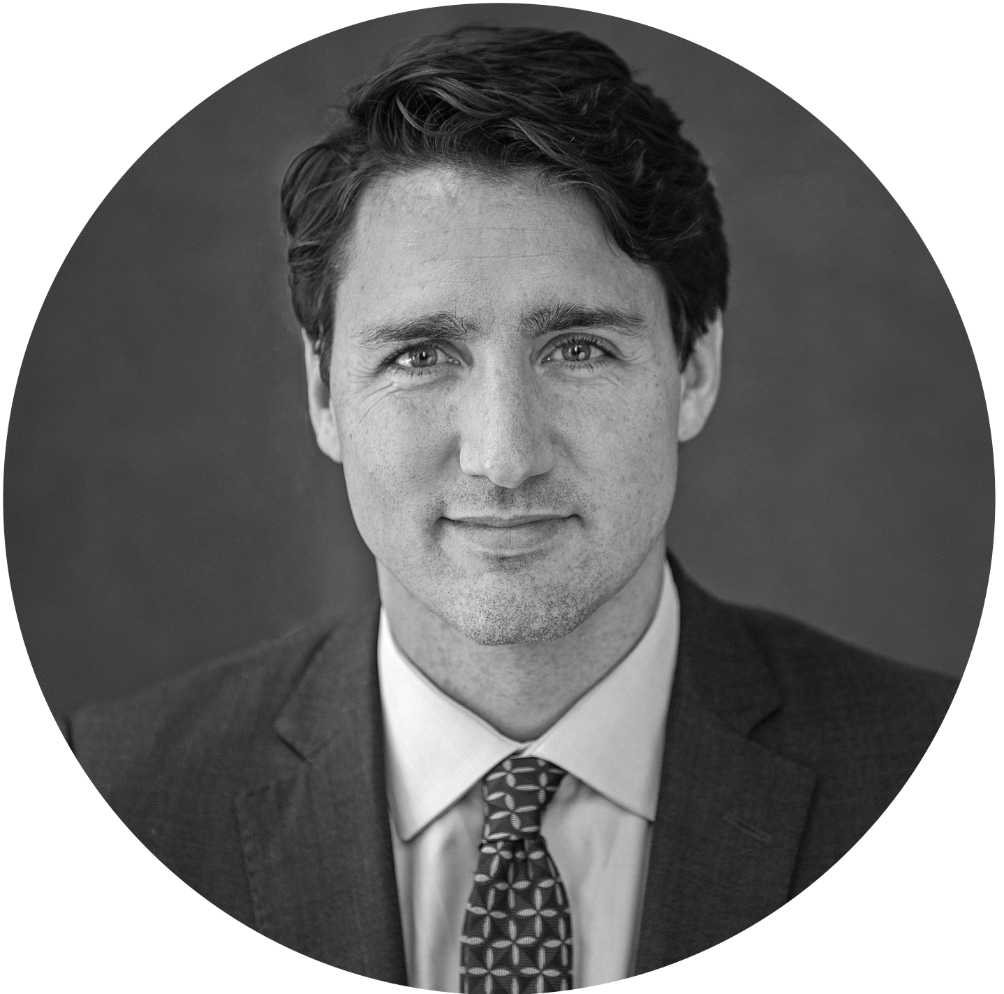
The Rt. Hon. Justin P.J. Trudeau, P.C., M.P. Prime Minister of Canada